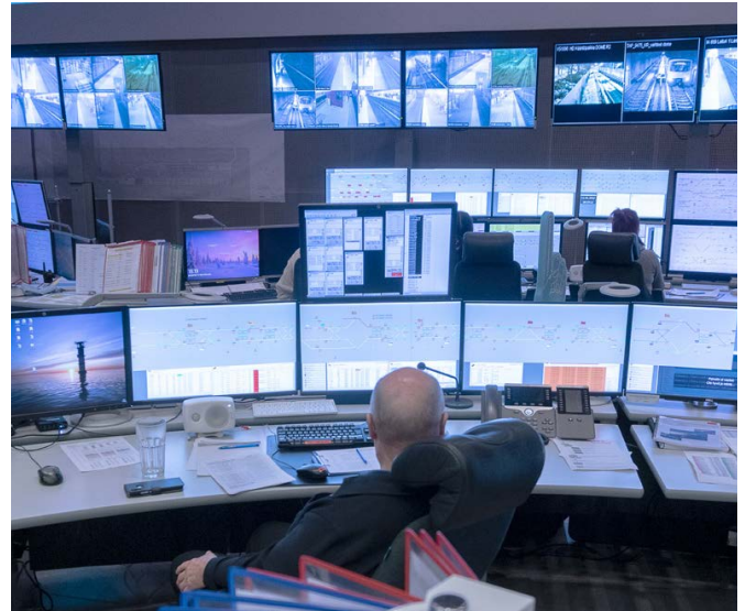
Mipro's ATS Automatic Train Supervision and control system ensures flexible and user specific traffic visualisation.