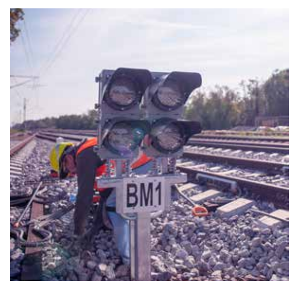
Mipro is renewing the signalling system on the Lääne-Harju track section in Estonia in cooperation with Estonian Railways Ltd.

Furthermore, Mipro provides services for system lifecycle management and complete project deliveries with safety assessment and verification.