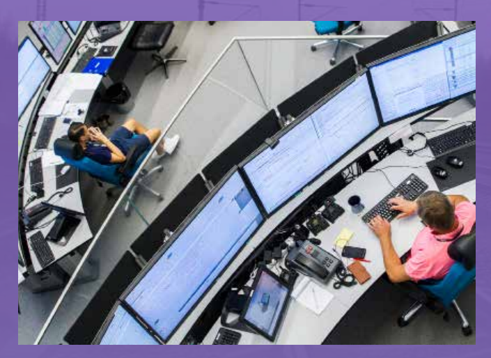
Mipro traffic management system manages Western Finland's remote control (TAKO) in the Viinikka traffic control centre of Finrail Ltd.

Versatile collection, analysis and visualisation of data is managed by TMS together with our situational awareness system in all environments.