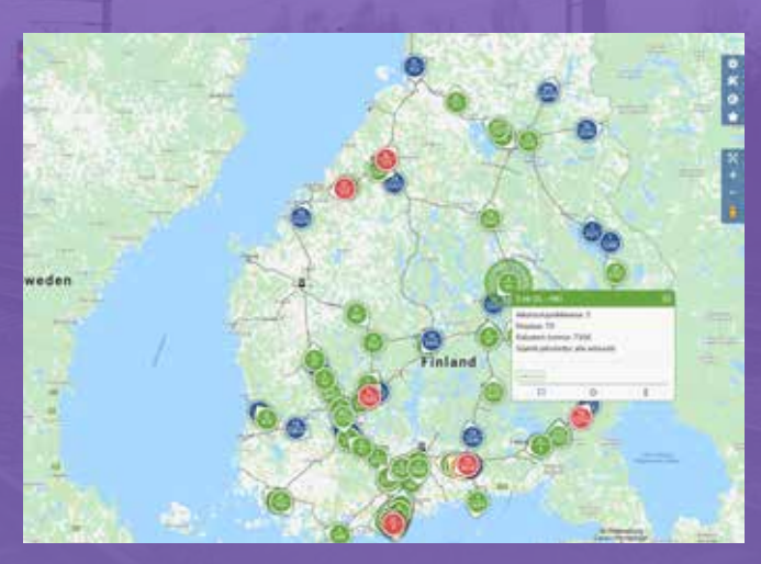
Mipro REGO situational awareness system manages operations in VR Group's operations centre.