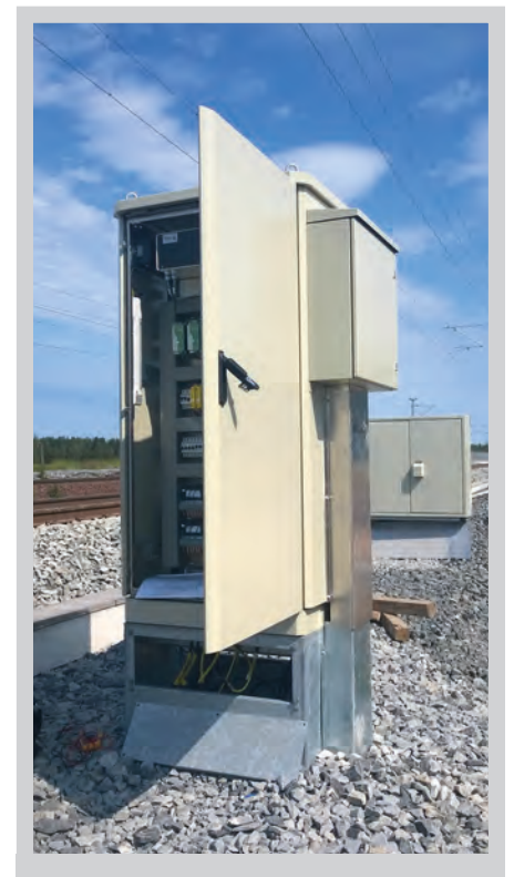
Figure 5: The interlocking system delivered by Mipro can be implemented according to the operative areas.

construction plan. When the substructure of the new track is ready, rail works and catenary power installations will start. After these have been completed, signalling and cabling work can start, usually in a very tight schedule. Tight schedules are, of course, the concerns of other constructors as well.