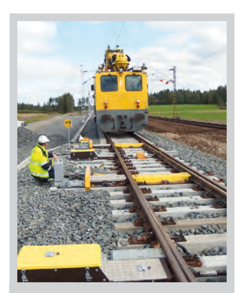
Figure 4: Accurate preplanning and open communication are required to enable various construction companies to simultaneously carry out their work.