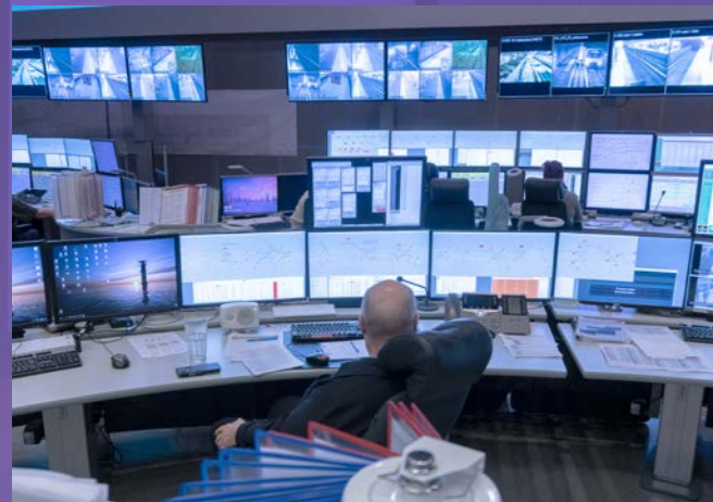
Mipro's ATS in the Herttoniemi control centre in Helsinki manages the metro traffic in the Finnish capital area.

Versatile collection, analysis and visualisation of data is managed by ATS together with our situational awareness system in all environments.